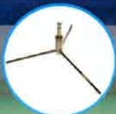
Tripod Cross Base