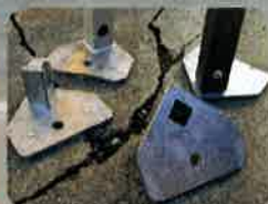
Oversized Heavy Gauge Cast Aluminum Feet