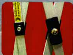
Comp vs. Oasis