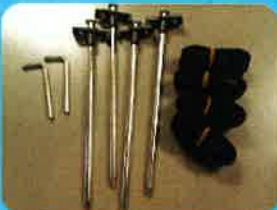
STAKE KIT & TOOLS Free with every tent purchase!