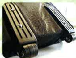
Oxford Roller Bag