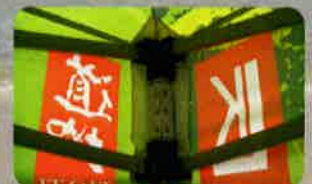
Engineered to Outlast the Competition