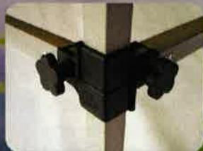
Oasis Universal Connector