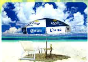
Beach / Promo Umbrellas

The OASIS LINE is available in a wide variety of sizes, styles, and colours. From promo to 5-star resort class, we have the fabric options and print capabilities to make a lasting impression.