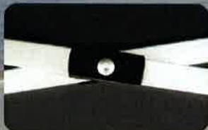
25% Thicker Truss Bars 3" Metal Truss Guards