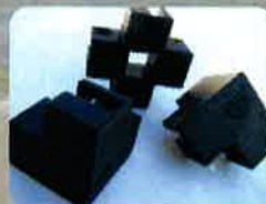
Fuji Brand N-6 Nylon Fittings