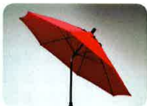
Aluminum Market Umbrellas