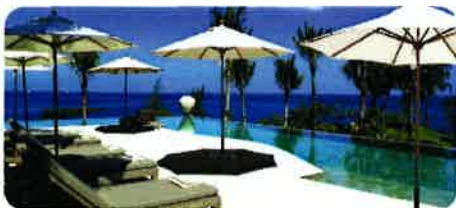
Wooden Market Umbrellas

The OASIS LINE is available in a wide variety of sizes, styles, and colours. From promo to 5-star resort class, we have the fabric options and print capabilities to make a lasting impression.