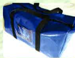
Vinyl Accessory Bag