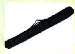
Rail Skirt Bag