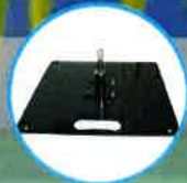
Steel Plate Base

Custom flags and banners of all sizes available on request